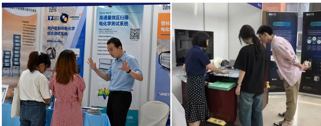
Exhibitors introduced their instruments to visitors