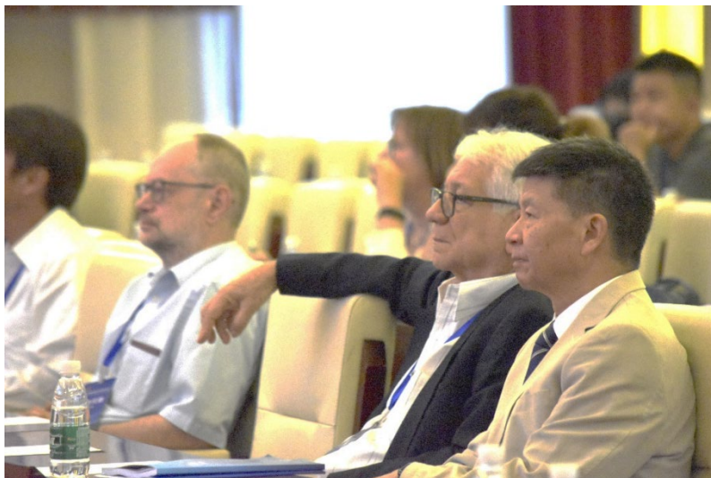
Experts and scholars gathered at the EIS2023 opening ceremony