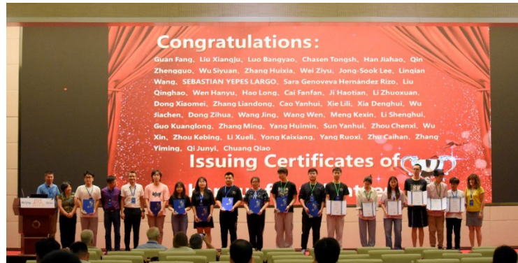
The volunteers were issued the certificates of honor at the EIS2023 closing ceremony