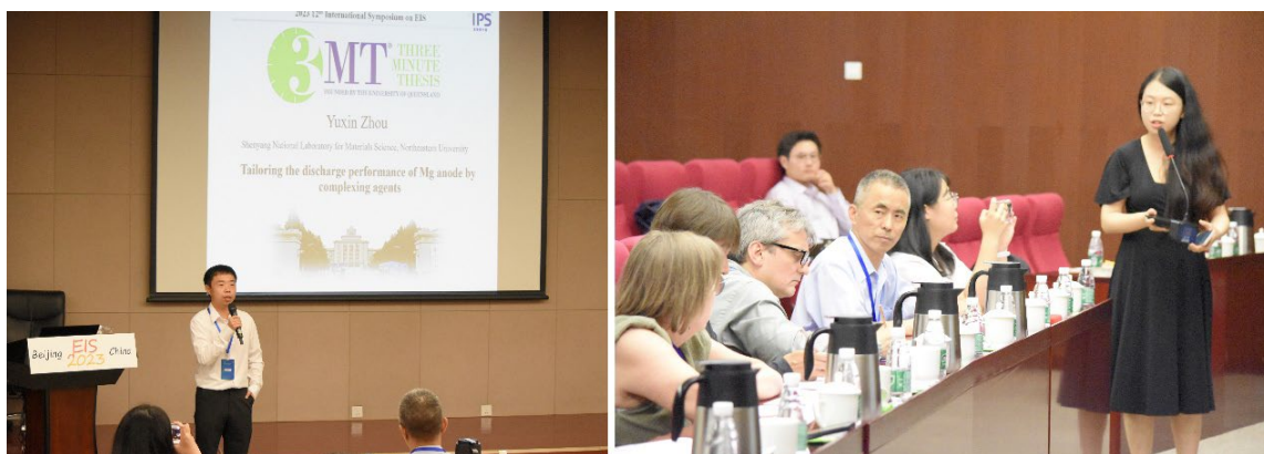
3MT speech competition and evaluation onsite